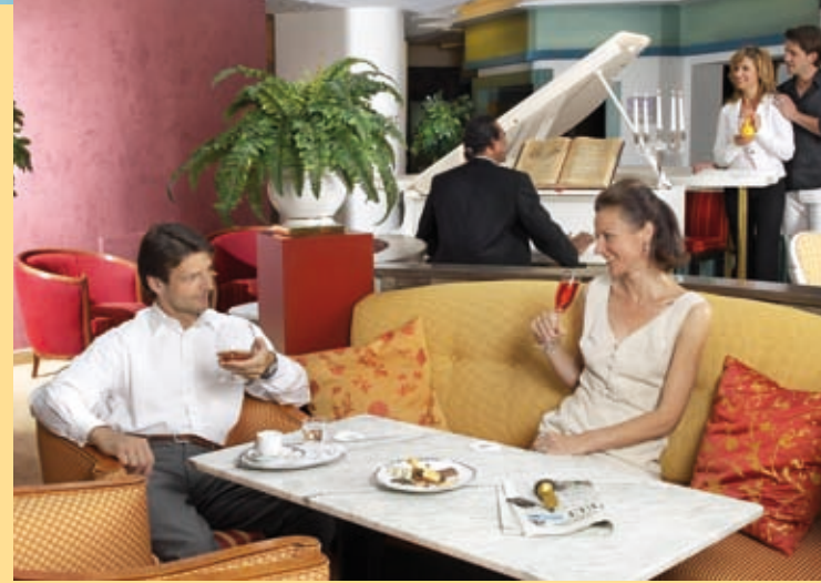
„Wiener Café“ with live piano music

Modern comfort and high-quality, stylish furnishings await you in the rooms and suites. Every one of our guestrooms has a direct-dial telephone, safe, flat-screen TV, radio, wireless LAN and a bathroom with bath, vanity mirror and hair dryer as standard. Depending on the room type, a large desk, sofa, armchair and trouser press is also provided. Non-smoking and disability-friendly rooms available on request.