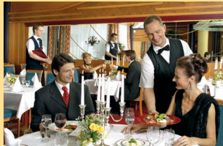
The „Kurfuerst von Bayern“ restaurant