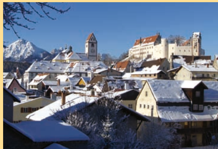
Fuessen in winter